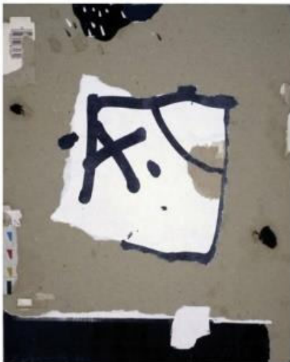
Secret Message (collage, 31 x 39 cm) 1994

Janiszewski's work was also reviewed favorably by The Washington Post , which named The Graphic and Fine Art of Poland's Jerzy Janiszewski: The Artist Whose Graphic Design Changed History to its "10 Best" list of gallery exhibits presented in Washington in 2012.