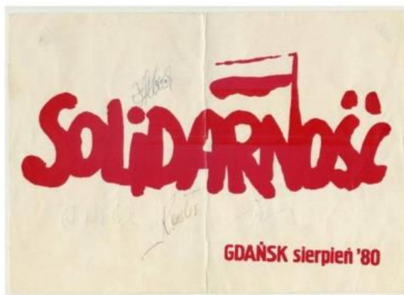
Solidarity logo (original print, 21 x 14.8 cm) 1980